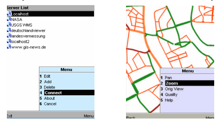
Figure 2: The mobile WMS clients provides a graphical user interface; typical functions like zoom and pan are available for exploration of the map obtained from the WMS server.

The client developed has a connection management and provides a user interface derived from the service metadata (cf. Fig. 2). It can not only display SVGT data, but also map images in PNG format and has the capability to parse most of the GetCapabilities document responded from WMS, which follow the OGC WMS 1.1.1 implementation specification.